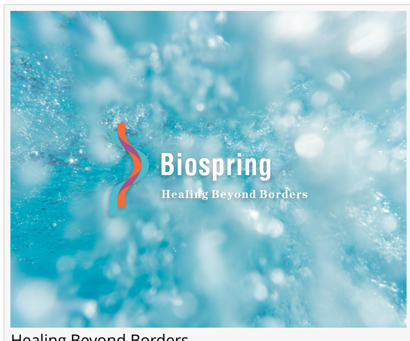
Healing Beyond Borders

The release of the development strategy is the first time that BioSpring, a start-up pharmaceutical company in Laos, has entered the public eye.