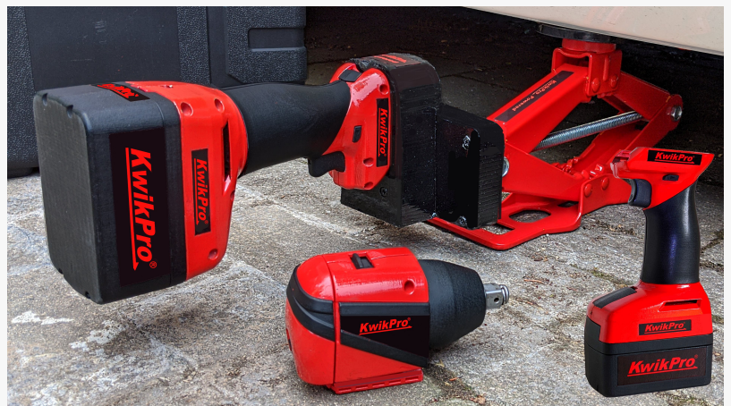
A KwikPro Motor Handle can power all kinds of things for work and leisure, including an adapted scissor jack to quickly lift the corner of a car.