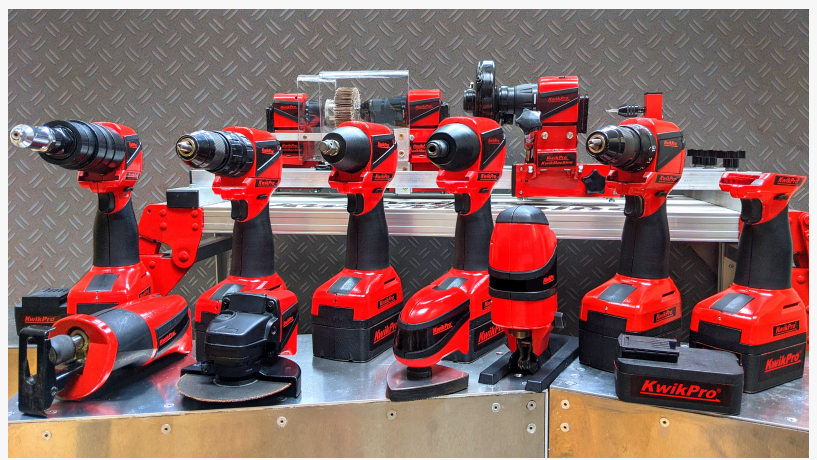
New KwikPro Motor Handles can power a whole range of tool attachments and much more.