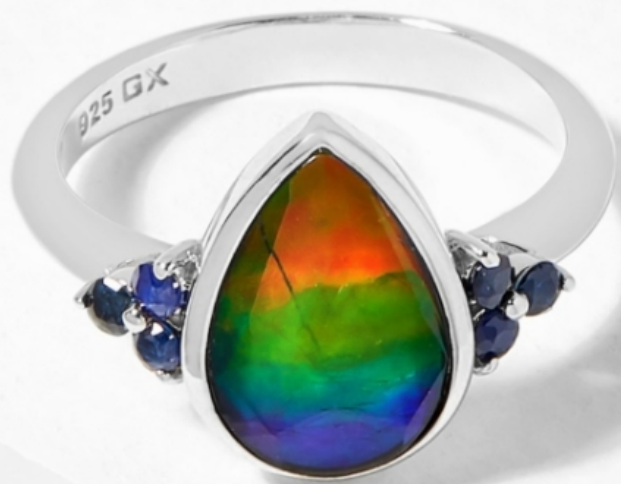
GEMXX Ammolite with Sapphire Silver Ring