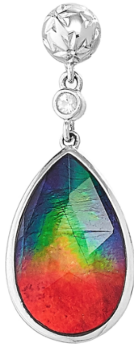
GEMXX Ammolite Silver Pendant