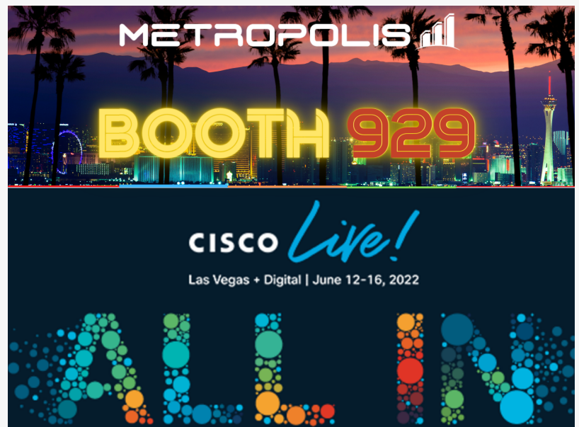
Expo XT showcased at CiscoLive

The Metropolis Team will be presenting how Expo XT delivers immediate value through improved productivity and exceeding business objectives by examining the capture of each user's participation (or lack of) in virtual meetings, voice and chat. Metropolis' dynamic UC analytic product includes historical