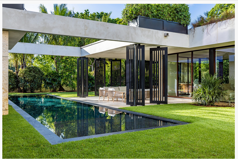
Ultimate Indoor-Outdoor Luxurious Living

The upstairs floors are crafted from European white oak. Olarte hand washed the wood to highlight the natural color to have a consistent, calm color palette throughout.