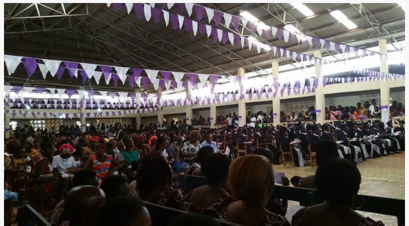
ACFI's Church Headquarters in Monrovia, Liberia

This press release can be viewed online at: https://www.einpresswire.com/article/576947536