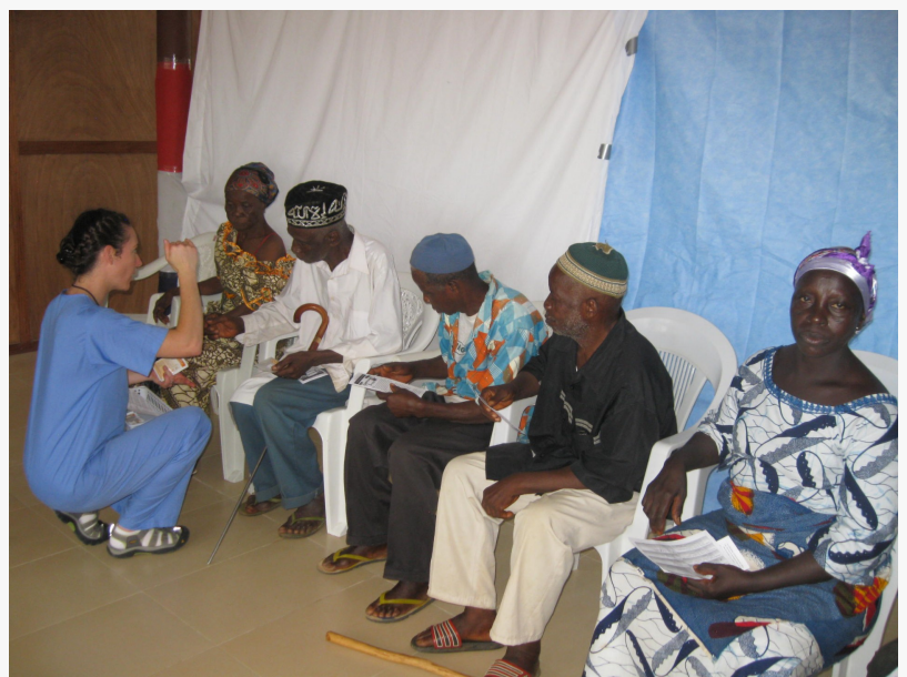
A Doctor giving medical care