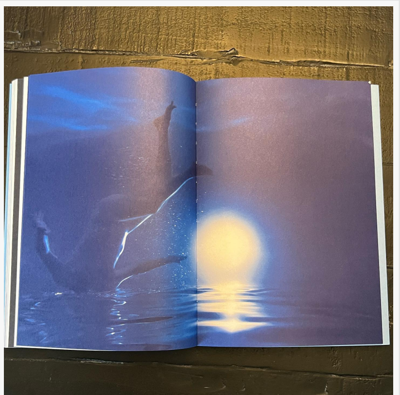
Ode to the Lake Sacalia

C Fodoreanu debuted his first monograph entitled 'street smart' in 2019 documenting at-risk