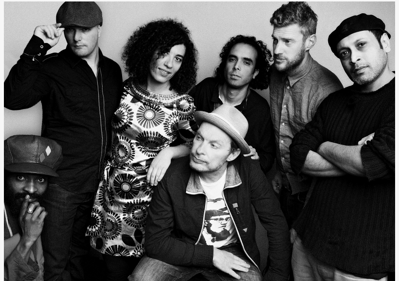
Brixton Based Band, Soothsayers