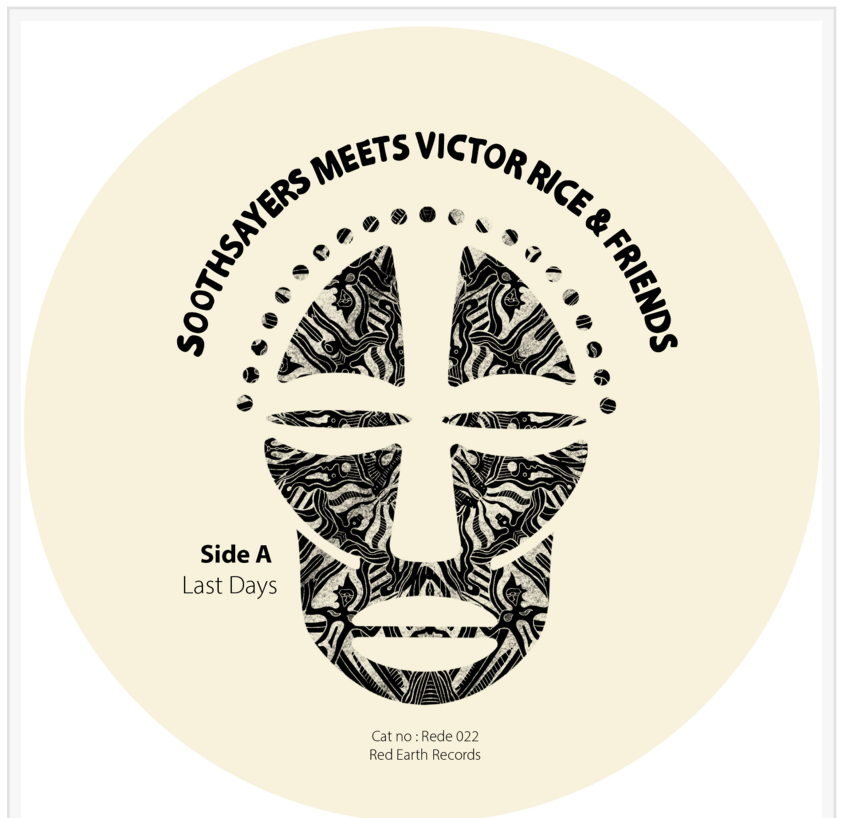
Last Days - Limited Edition 10" Single