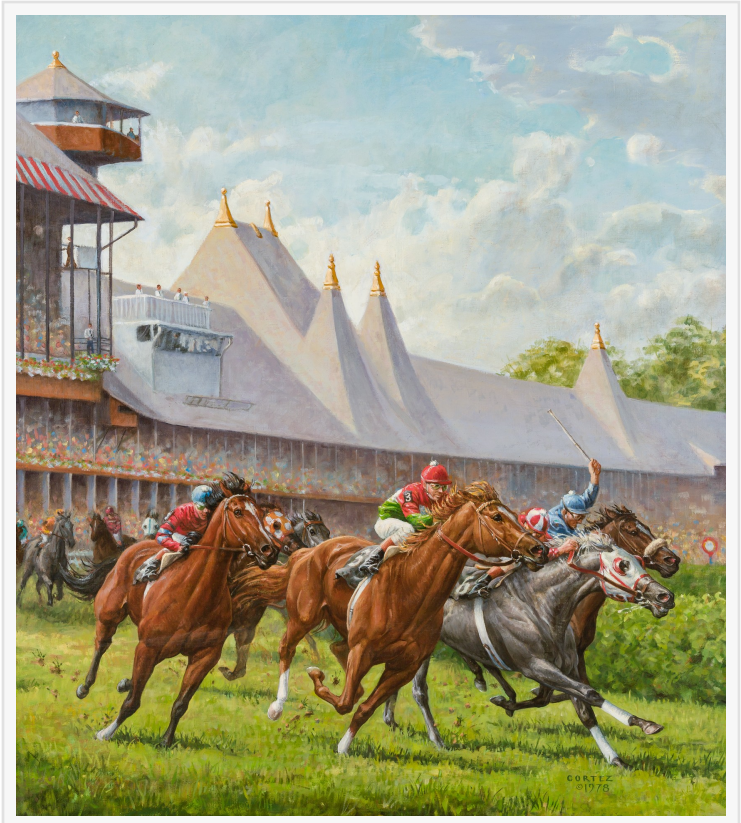
Oil on canvas by Jenness Cortez (American, b. 1944), titled Saratoga Horse Race, signed, 36 ¼ inches by 32 inches (Estimate: $6,000-$8,000).

There are lovely portraits by Ivan Olinsky featured in the sale. Collected together, the paintings are each well-framed and in good condition. Leading the group is a portrait titled Madeleine, Young Woman in a Patterned Blouse, estimated at $4,000-$6,000. There are also portraits of Marguerite, a young woman with red hair, estimated at $3,000-$5,000; The Green Bodice, a full-body portrait of a young woman in an interior, estimated at $3,000-$5,000; and Dancer, estimated at $2,000-$3,000. There are also two nudes by Olinsky