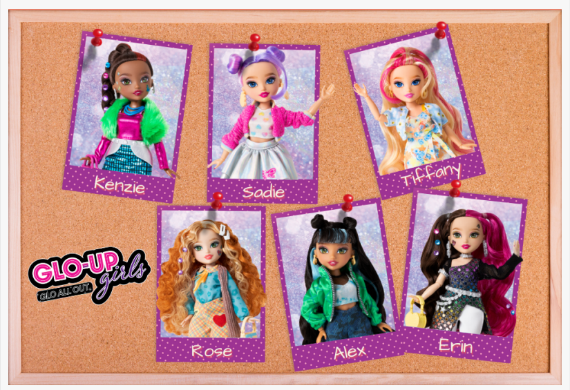
Each Glo-Up Girls doll comes with unique fashions, accessories and personalities.

bedazzle your doll's hair as well as your own!