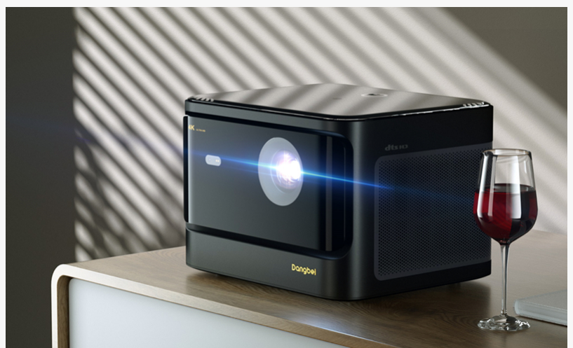
Dangebi Mars Pro

People choose projectors instead of TV because the former has a giant screen size. Therefore, a projector with a giant screen is preferred. Most home projectors have a max screen of 120-200 inches. A projector with a max screen size of 300 inches is better.