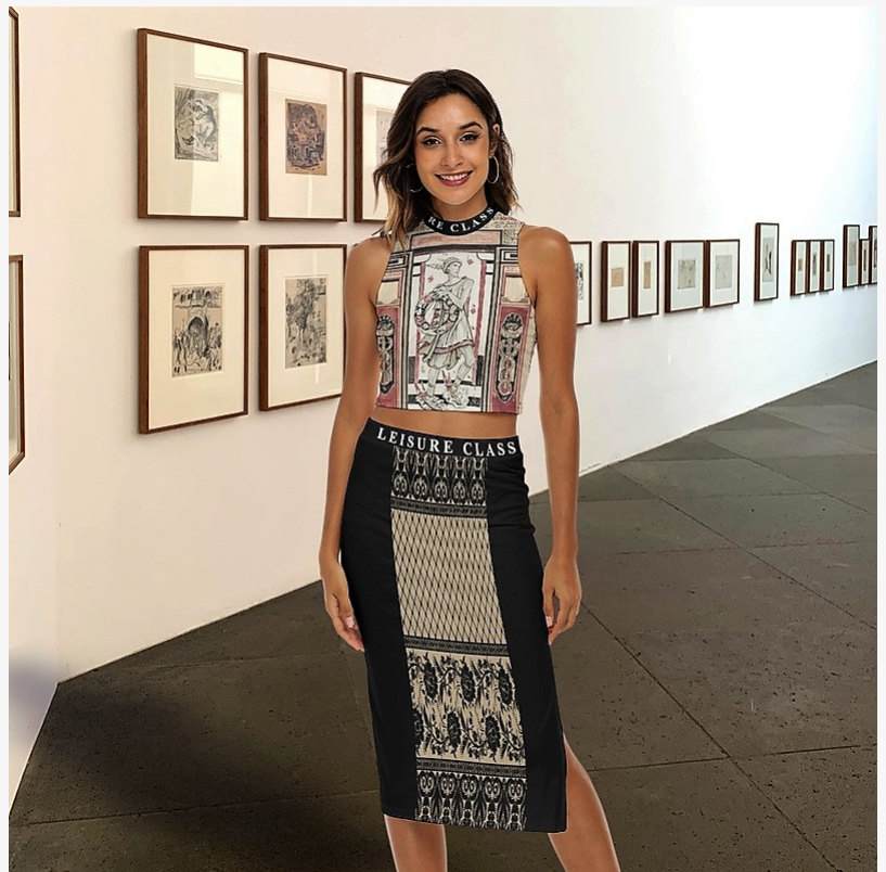
Fashion 4 The Leisure Class -The Goddess Series -Mesopotamian Queen