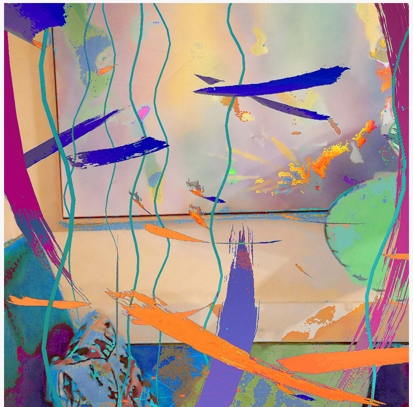
Artwork Nots by Darcy Gerbarg

Contemporary & Fine Art Biennale Basel shows selected artists from all over the world with a precise view and technique. Art is a mirror of society and shows how artists react to social and political changes, but also what moves artists in different phases of their lives. Art polarizes, but also unites and can be a creative source of inner strength for many viewers. The connecting role of art and diversity was important for curator of the Biennale Heinz Playner when selecting the artists for this exhibition.