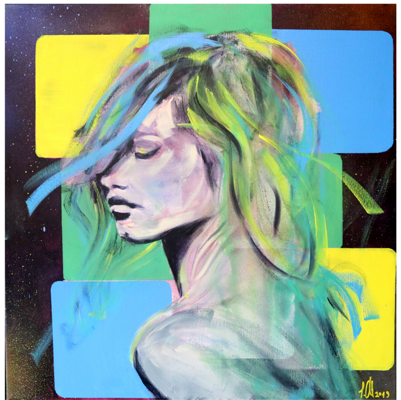
Artwork " Blue, green, Yellow" by Simon Abt