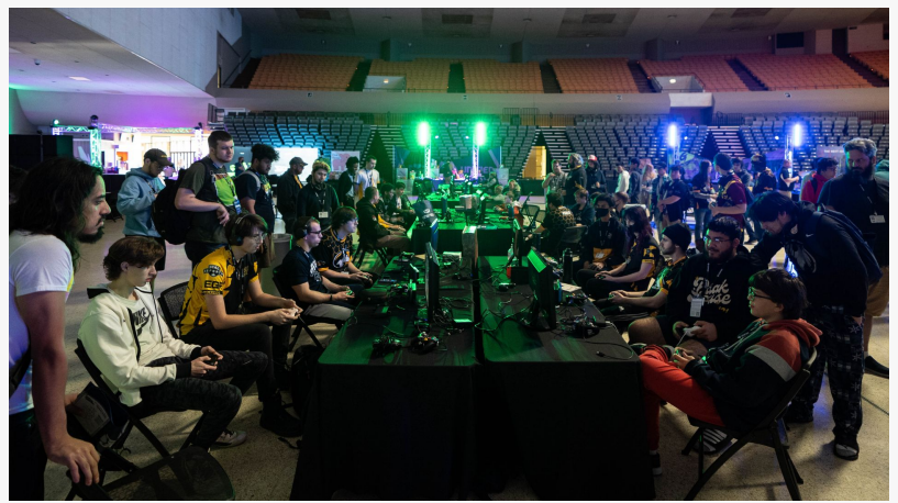
Super Smash Bros. Ultimate players compete at a recent Unified event.