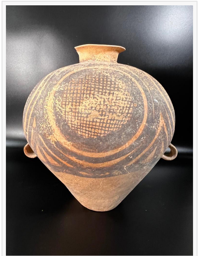
Chinese pottery jar, 15 ½ inches tall, possibly a Neolithic ceramic from the Yangshao Culture (5000 BC-3000 BC) (est. $400-$600).

Neue Auctions will follow this sale with an auction featuring the lifetime collection of rare and exquisite Moser glass pieces of Carol and Leslie Gould on Saturday, July 30th. The auction will be online-only and will start at 10 am Eastern time. Watch website for details as sale date nears.