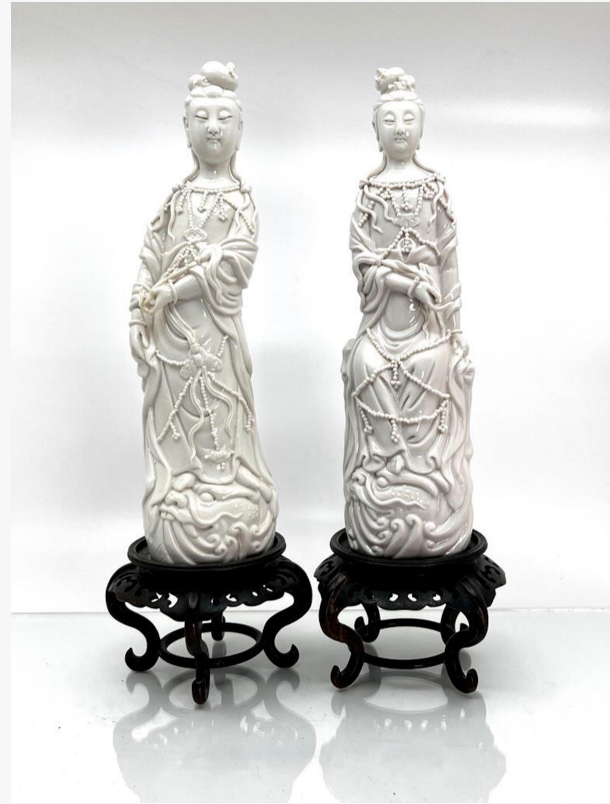
Pair of blanc de chine porcelain Guanyin, representing the type of porcelain figurines produced in Dehua, Fujian Province, 12 inches tall with stand (est. $100-$200).

Cynthia Maciejewski Neue Auctions +1 216-245-6707 email us here