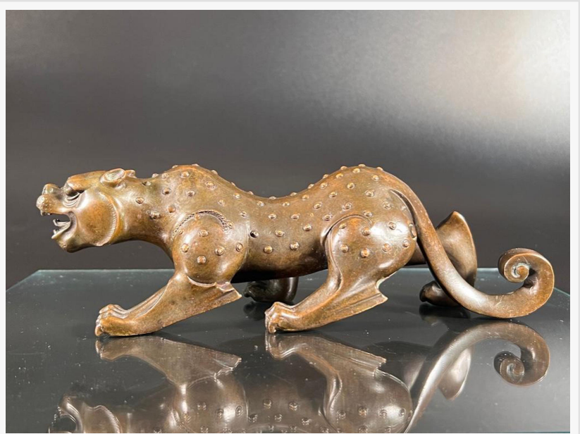
Chinese bronze striding tiger figure, 10 inches in length, featuring coiled decorative patterns on the tiger's back that attest to the quality of the casting (est. $500-$800).

BEACHWOOD, OH, UNITED STATES, June 16, 2022 /EINPresswire.com/ -- On Saturday, June 25th, Neue Auctions will offer, online, the Asian art collection of the late Marvin Drucker , including French furnishings . The auction, beginning at 10 am Eastern time, will feature bronzes, porcelains, carved hardstones, lacquer ware, cloisonné, snuff bottles, Wedgwood, Luster ware, Lalique glass, 18th century English porcelains and more.