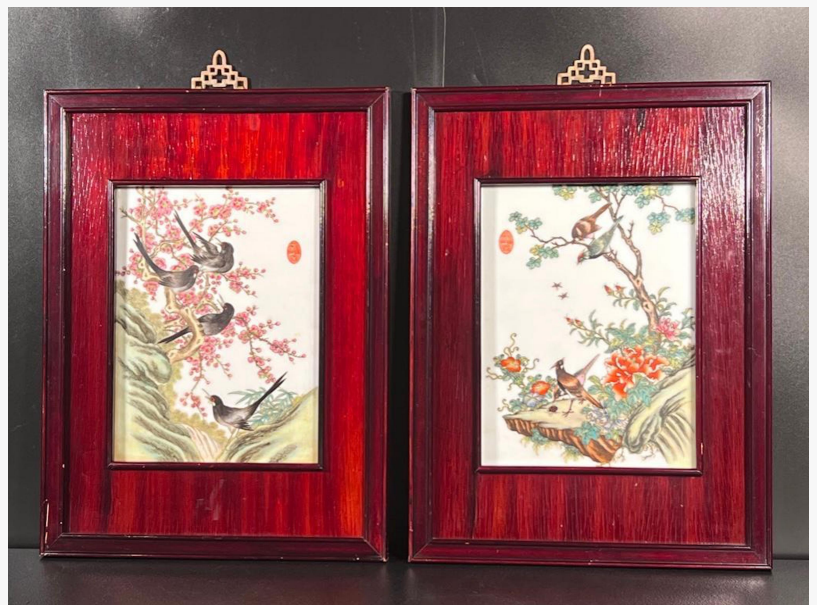
Pair of framed Chinese porcelain plaques painted with seasonal themes of birds and flowering trees, each one 19 ¼ inches tall by 14 ¼ inches wide (est. $100-$300).