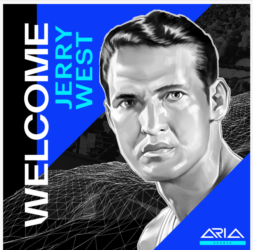
NBRPA Legend Jerry West

To follow along with the NBRPA, find them on social media at @NBAalumni on Twitter, Instagram, YouTube and Twitch. ###