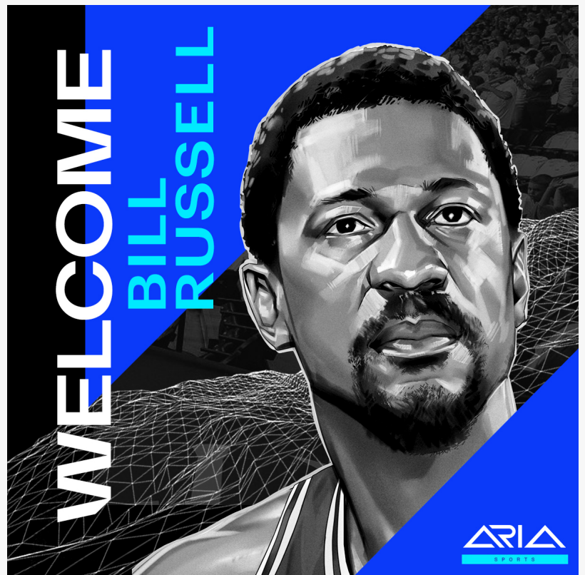
NBRPA Legend Bill Russell