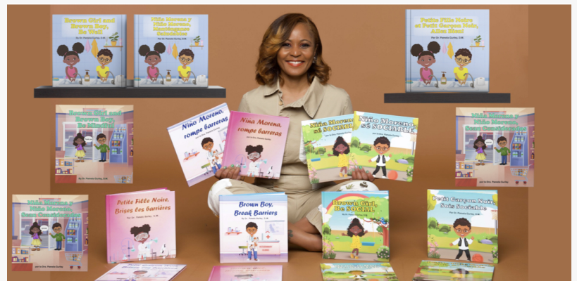
BGBB Multilingual Book Series