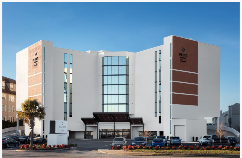
Delta Hotel, Virginia Beach