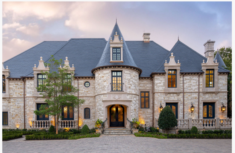
9727 & 9715 Audubon Place | Grand gated estate with next-door lot