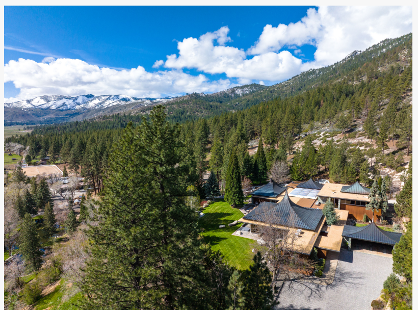
Steen Ranch | Ultimate 25+ acre ranch in verdant Washoe Valley near Reno

Offerings include Steen Ranch, 25+ acres at the foot of the Sierra Nevada Mountains; a prestigious Belvedere Island estate framing unobstructed views of The Golden Gate Bridge, San Francisco Bay & its skyline, featuring a 60-foot indoor pool; a Martha's Vineyard estate with a private beach and clear ocean views; a luxury estate located within the renowned Old Preston Hollow estate, offering seven bedroom suites along with a neighboring buildable lot; and historic Laurel Hill, an immaculate Tudor manor on 57 acres once owned by the Rockefellers, located just one hour from Manhattan on Long Island's Gold Coast.