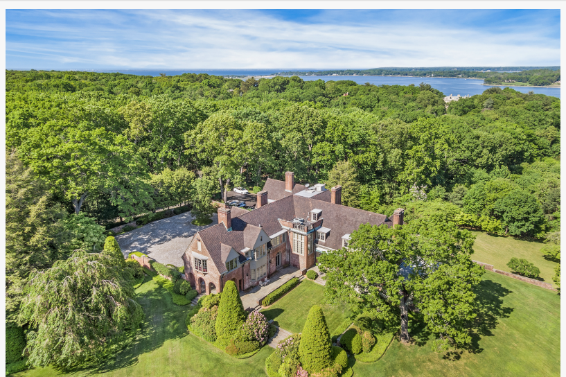
222 Cleft Road | Spectacular 57-acre estate on Long Island's Gold Coast

337-333 Belvedere Avenue | San Francisco Bay Area, CA Bid Now Through 27 June