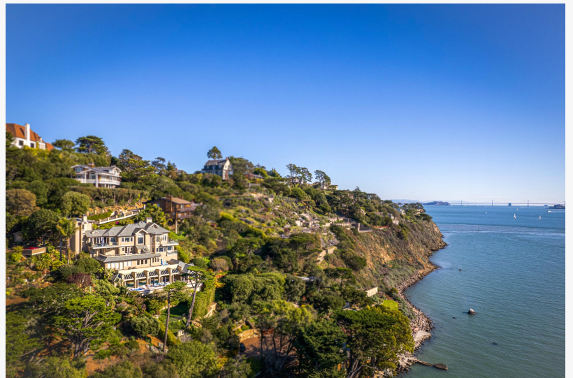
337 Belvedere & 333 Belvedere | Incredible 11,200sf estate on private 1.15+ acre double lot