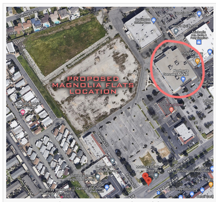
10481 Magnolia Avenue, Riverside, California NOW via Google Satellite view

Concurrently with the filing of its Complaint, Northgate Market also applied for and was granted a preliminary injunction enjoining (blocking or prohibiting) the Magnolia Project, the largest multifamily housing community recently approved in the City of Riverside. Thus, pending the outcome of the ongoing litigation, development of the Magnolia Project is on hold. In the interim, Magnolia and Realm have appealed the preliminary injunction on the basis the easement agreement's purpose is for ingress,