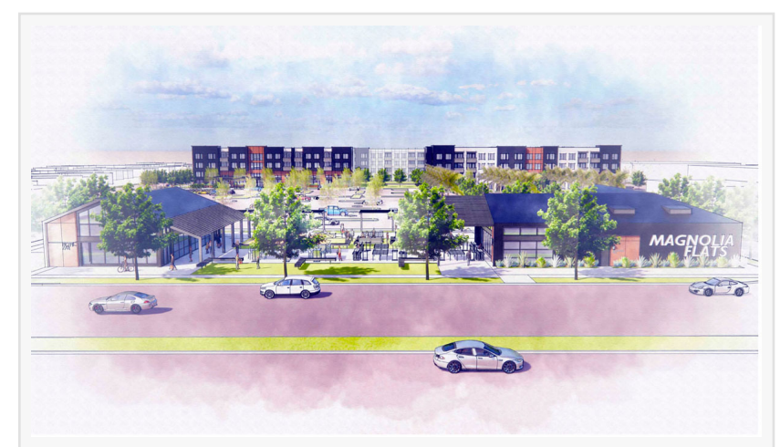
Magnolia Flats Dream of Bringing Affordable Housing to Riverside California Community. Watercolor Rendering

Magnolia Partnership LLC ("Magnolia") is the owner of 16 acres of mixed-use zoned property at 10481 Magnolia Avenue, Riverside, California (the "Magnolia Property"). Magnolia purchased the Magnolia Property to construct an attractive mixed-use commercial development consisting of desperately needed workforce multifamily housing (450 apartments) and 9,000 square feet of retail space (the "Magnolia Project"). Magnolia's goal in developing the Magnolia Project is to provide much-needed workforce housing for hundreds of middle- and lower-income families in the Riverside community. This new multifamily housing development would also greatly help the City of Riverside achieve compliance with the State of California's Regional Housing Needs Allocation ("RHNA") requirements. The City of Riverside is required to provide a minimum of 18,415 new housing units for the 2021-2029 Housing Element Cycle. An added benefit of the Magnolia Project would be additional customers frequenting the businesses surrounding the Magnolia Property, businesses which include the proposed