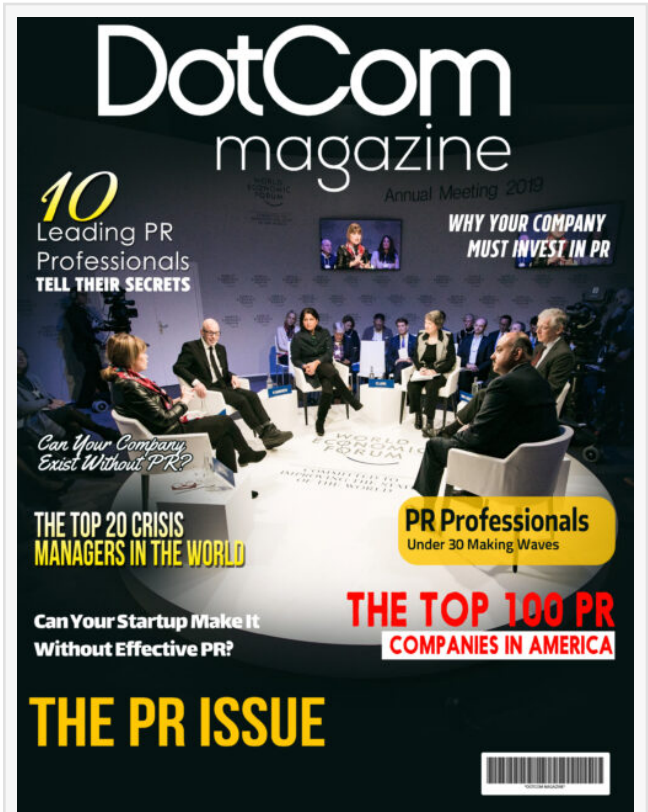
The DotCom Magazine PR Issue

This press release can be viewed online at: https://www.einpresswire.com/article/577384782