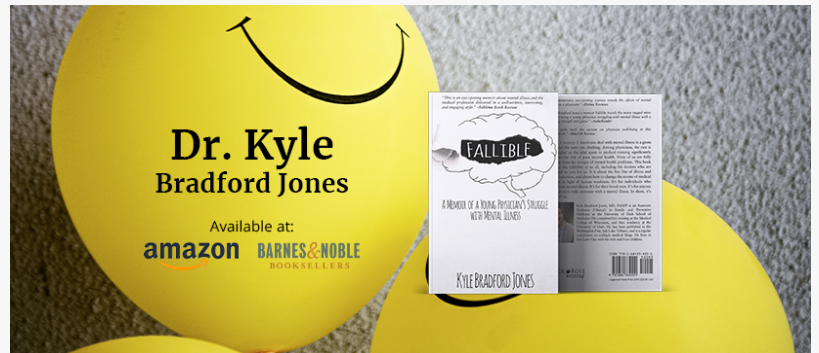
Fallible: A Memoir of a Young Physician's Struggle with Mental Illness Available on Amazon and Barnes & Nobles

This press release can be viewed online at: https://www.einpresswire.com/article/577408959