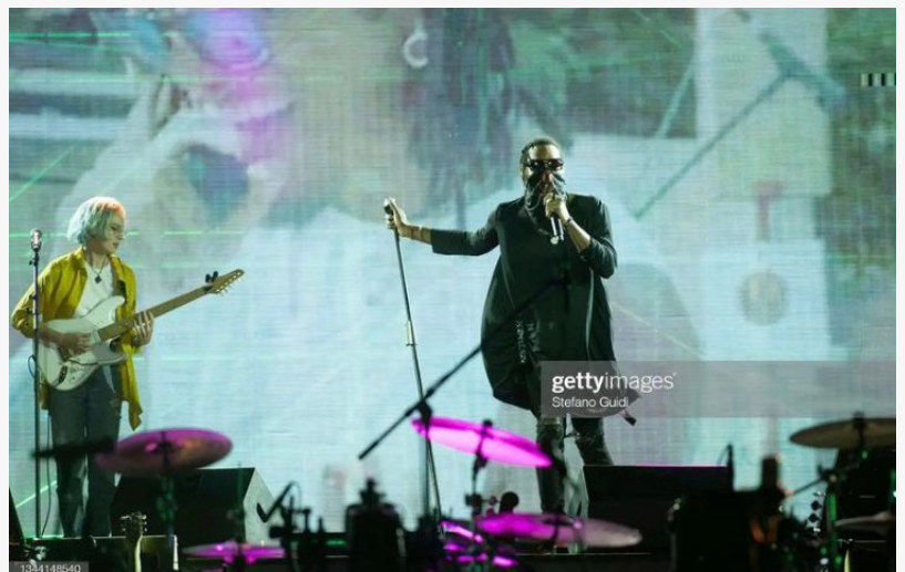
AY Young in Performance

AY is hard at work on the world's first sustainable album recorded in a carbon neutral way containing the 17 songs - one for each of the UN's Global Goals. The first singles from Project17, songs: "Regeneration" & "AYO" are set to premiere in the Netflix documentary "Down to Earth," with Zac Efron, alongside AY's independent release.