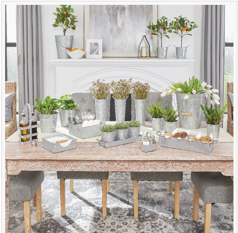
Walford Home's Garden Collection