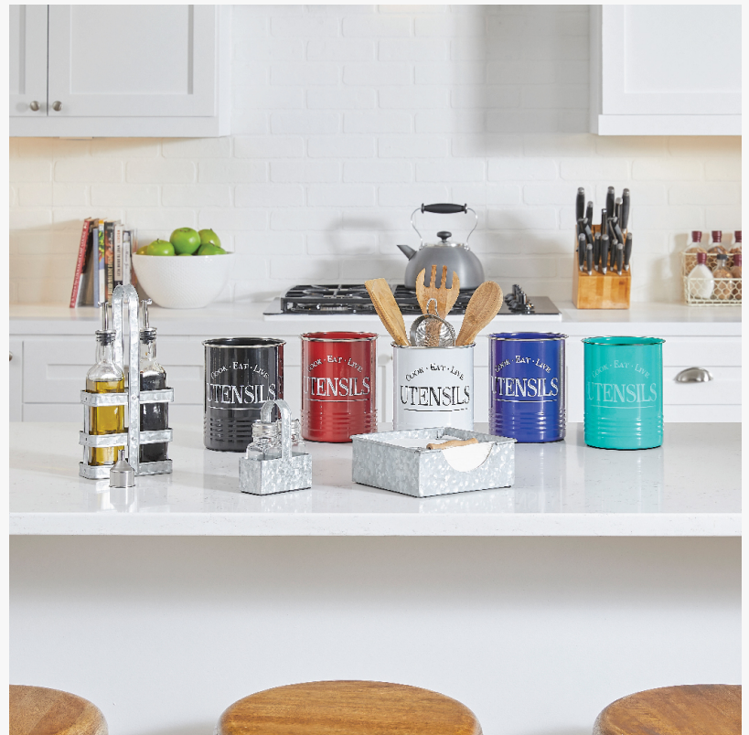
Walford Home Kitchen Collection - Farmhouse Decor