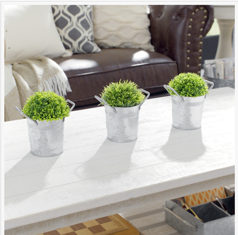
Walford Home 4 Inch Pot Set