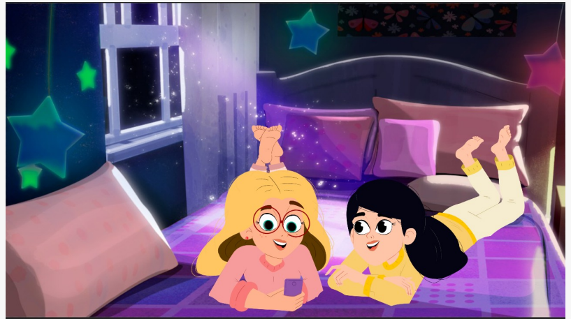
A 'Friendship' Sleepover

This press release can be viewed online at: https://www.einpresswire.com/article/577549219