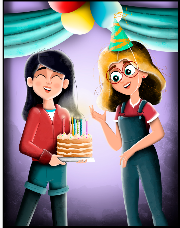
A 'Friendship' Birthday

Communications Immix Studios media@immix.io