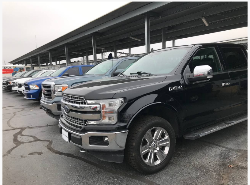
Cars Inventory Indy Auto Man