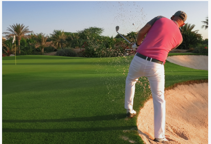
British Amateur, Eugene — Enduring the Emotional Rollercoaster of Golf

This press release can be viewed online at: https://www.einpresswire.com/article/577627384