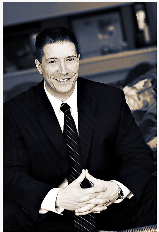
Kronos Rising series author Max Hawthorne

This press release can be viewed online at: https://www.einpresswire.com/article/577649841