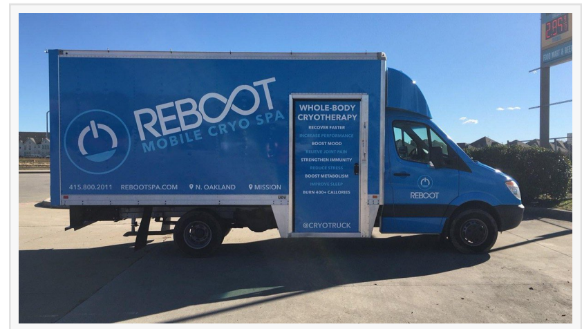
Custom mobile cryotherapy wellness and recovery center built by The Spa Butler

When considering starting a cryotherapy business, don't let this scare you off. The Spa Butler is changing the cryotherapy game with a direct VIP service. Read on to learn more.