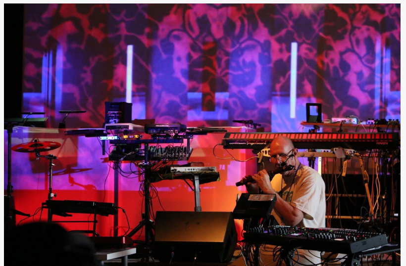
Zero Ohms recently performed at the Mountain Skies Electronic Music festival in North Carolina.

This press release can be viewed online at: https://www.einpresswire.com/article/577683047