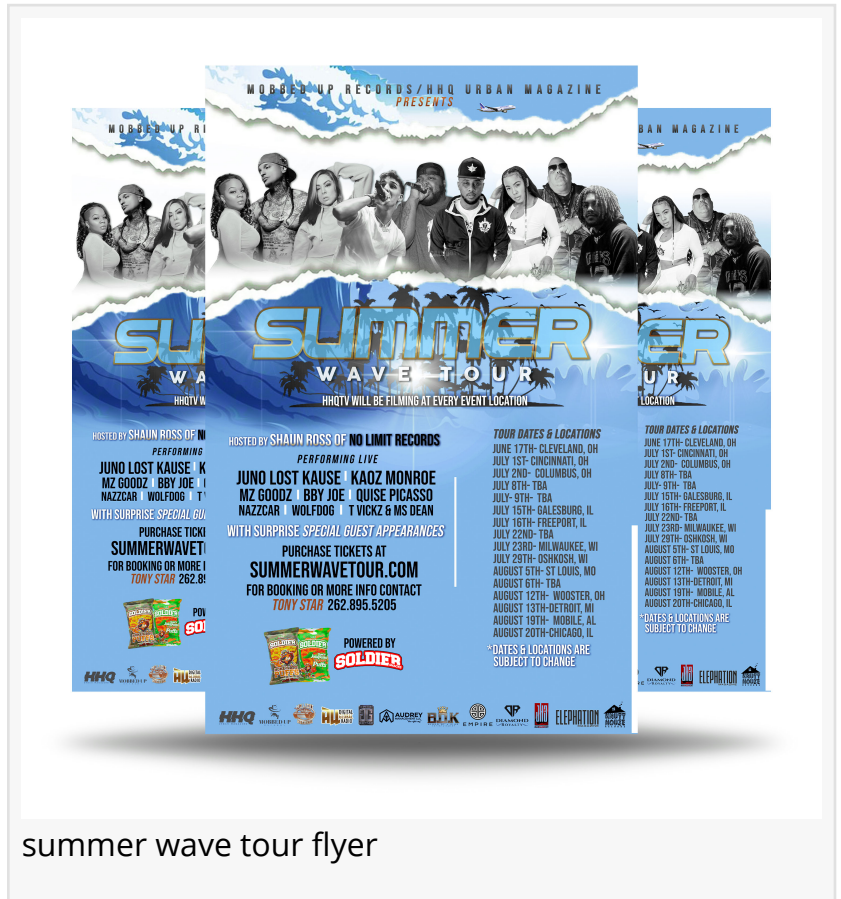
summer wave tour flyer

Mobbed Up Records is one of the fastest-growing companies in Chicago that's quickly becoming