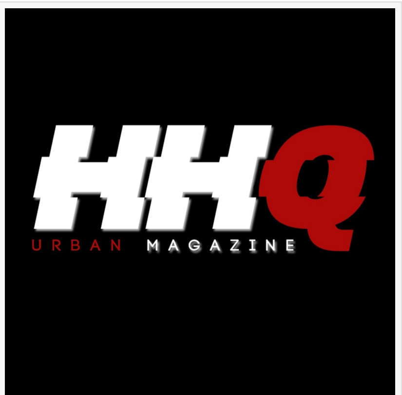
HHQ Urban Magazine Publication