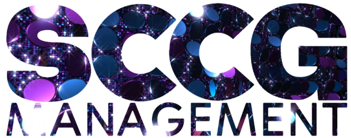
SCCG Management Logo