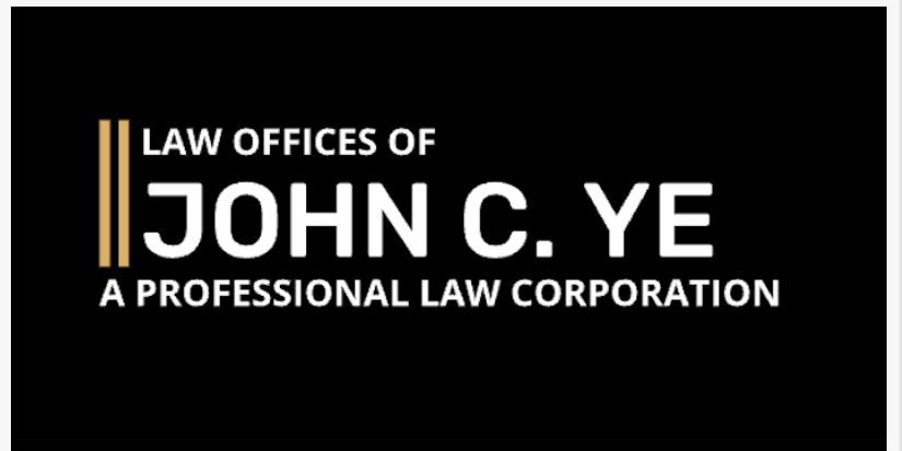
Law Offices of John C. Ye

from the offender. However, personal injury lawsuits can be overwhelming for many. The plaintiff might not be prepared for the extensive laws related to personal injury cases, and they might lose out on a rightful claim and financial compensation. A timely approach in terms of hiring an experienced accident attorney or professional personal injury firm is the key to getting fairly compensated for economical and emotional damages. Los Angeles personal injury lawyers at the Law Offices of John C. Ye are bringing new dynamics for people across Los Angeles, California, providing the sufferer more clarity about the entire process, and a free consultation upfront.