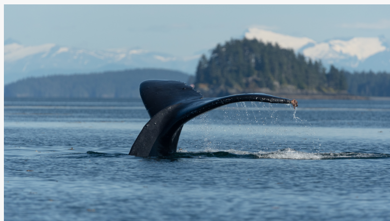
Humpback whale on the feeding grounds in Southeast Alaska. NOAA permit 19703

NOAA's Office of National Marine Sanctuaries serves as the trustee for a network of underwater parks encompassing more than 620,000 square miles of marine and Great Lakes waters.