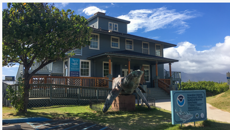
Hawaiian Islands Humpback Whale National Marine Sanctuary offices and visitor center in Kihei, Maui.

Every winter, thousands of humpback whales travel to the warm, shallow waters of Hawai'i to mate, give birth, and raise their young. Hawaiian Islands Humpback Whale National Marine Sanctuary protects these whales and their habitat. From November through April, visitors to the sanctuary can see whales from shore and at sea.