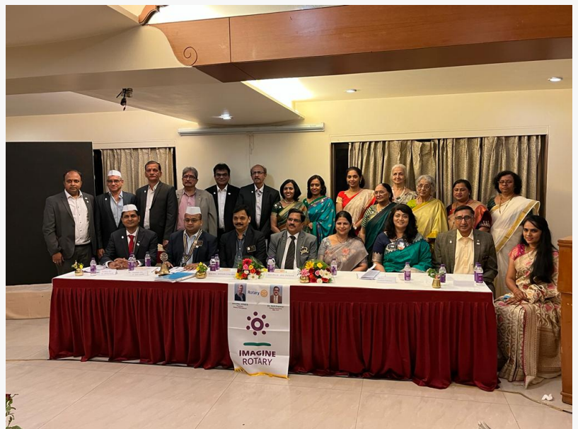
Glimpse of Installation Ceremony - Rotary Club of Pune Deccan Gymkhana

The ceremonial change of leadership team in the Rotary Club of Pune Deccan Gymkhana (chartered in 2003) was organized in a grand event executed to perfection by the club team on June 21, 2022, at Hotel Deccan Royale.