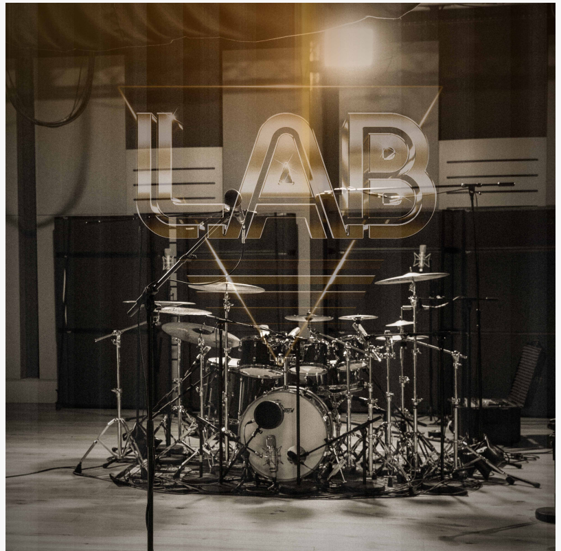
L.A.B Live At Massey Studios

Following on from multiple number one singles & albums, alongside a growing list of platinum sales & awards across New Zealand & Australia, this is the band's first ever release featuring a small collection of live tracks.