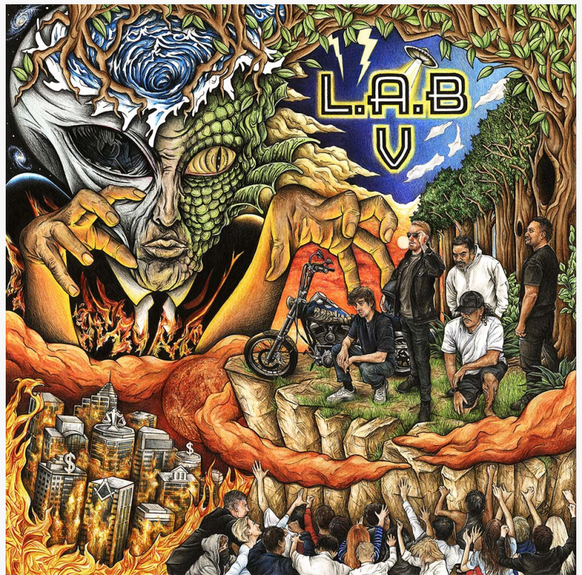
L.A.B V album cover (art: Natalie Mentor)