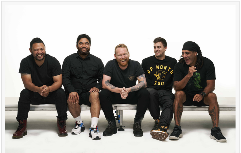
Maori New Zealand Band, L.A.B