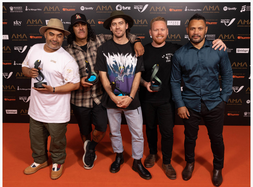
L.A.B win four 2021 Aotearoa Music Awards: Single Of The Year; Album Of The Year; Best Group & Best Roots Artist