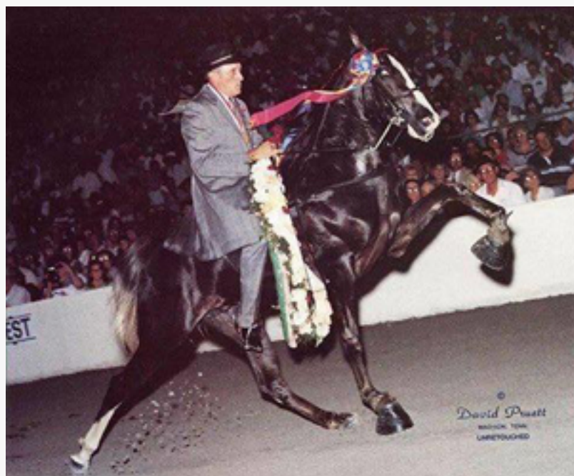
1992 Tennessee Walking Horse 2-Year-Old World Grand Champion JFK

WASHINGTON, D.C., DISTRICT OF COLUMBIA, USA, June 22, 2022 /EINPresswire.com/ -- The U.S. House Committee on Energy and Commerce has announced a Subcommittee markup on the Prevent All Soring Tactics (PAST) Act, H.R. 5441, and the Save America's Forgotten Equines (SAFE) Act, H.R. 3355, to be held on Thursday, June 23, 2022 at 10:30 AM EST. The Committee action follows a hearing on both bills in May.