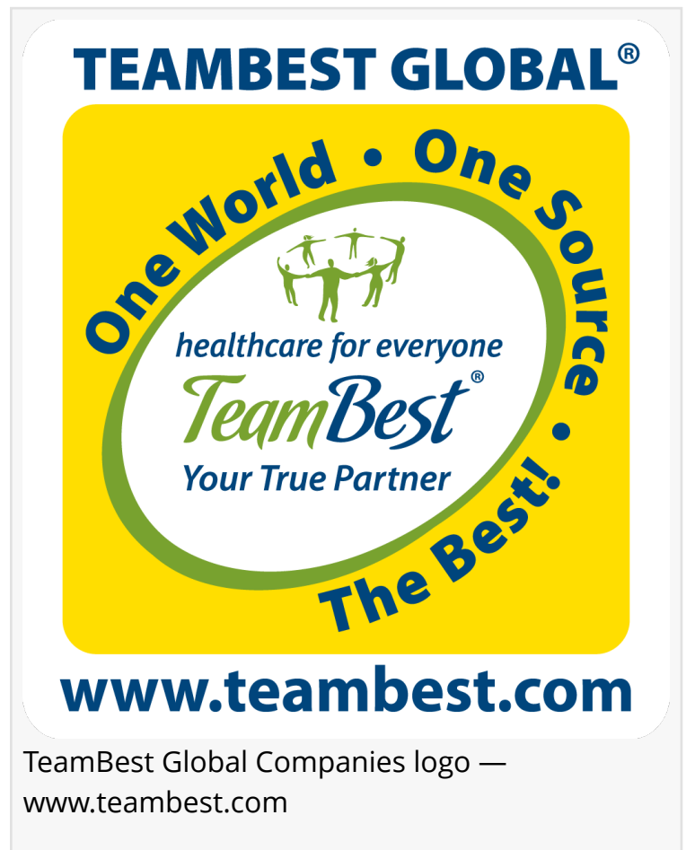
TeamBest Global Companies logo — www.teambest.com