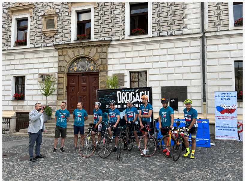
Drug Free Cyclo run with Mayor in Czech