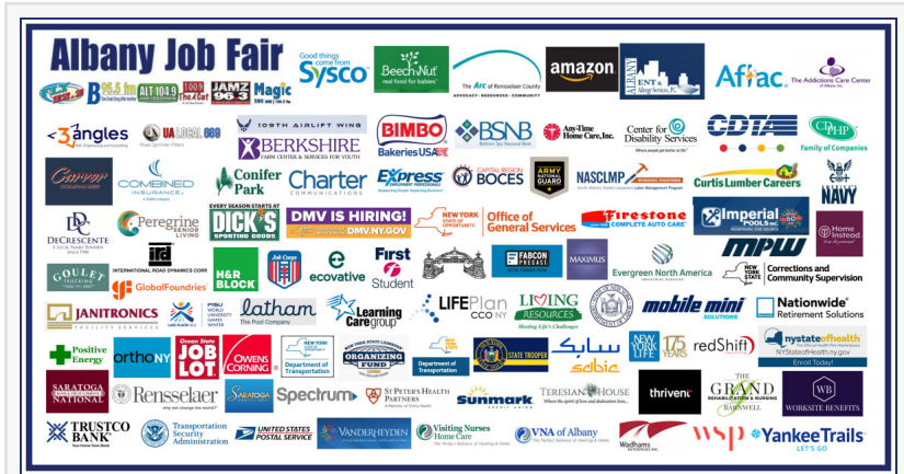
Recruiters On Site

The Albany Job Fair is Wednesday July 13, 2022 at the Holiday Inn and Conference Center at 400 Old Loudon Road, Latham New York. The Albany Fair is underwritten by Albany Broadcasting,