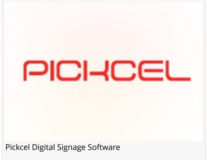
Pickcel Digital Signage Software