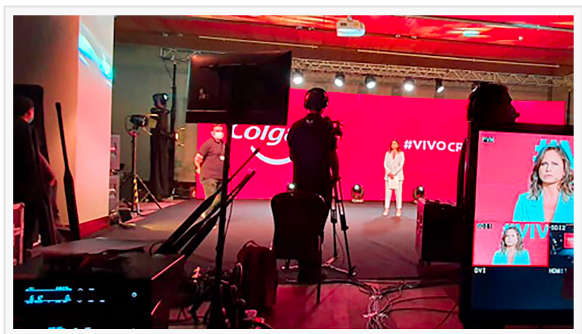
RLALATAM Virtual Event Recording Studio

SAN JOSE, CA, UNITED STATES OF AMERICA, June 27, 2022 /EINPresswire.com/ -- Today Engagez, a global leader in digital engagement and virtual event solutions, and RLALatam, the largest <u>audiovisual</u> <u>provider</u> in Latin America, and a leading global event production