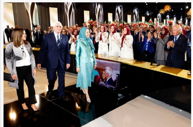
Former Vice President Mike Pence on Thursday visited the Iranian opposition Organization of (PMOI/MEK) in Ashraf 3 near Tirana in Albania, praising their decades-long struggle to overthrow the theocratic regime and establish a democratic government in Iran.

Thank you all for standing strong in the name of freedom," Vice President Pence said in his speech to a large gathering of PMOI/MEK members at Ashraf 3, who were joined by several