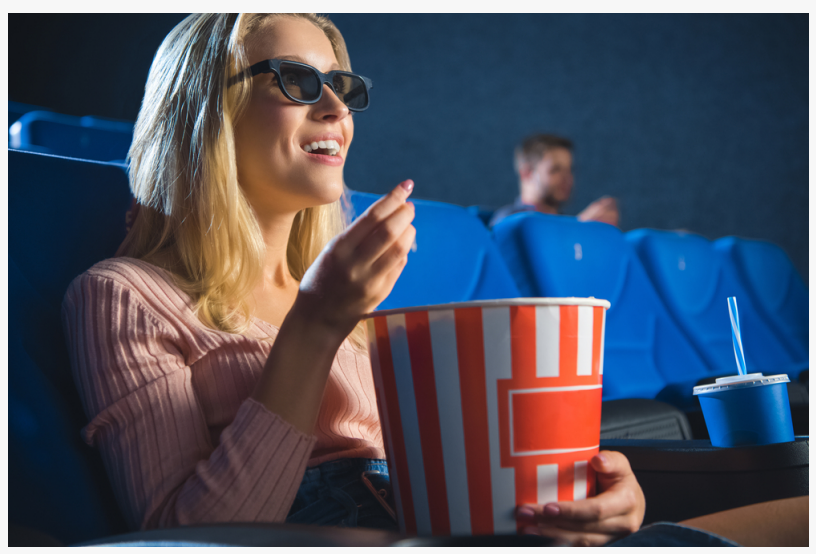
Cleanbox Sanitizes many shared devices to Hospital Grade Standards (99.999% Decontamination)

An employee can spend a lot of time trying to use the wipe on every surface and still fail to clean every spot. The proper application of UVC light hits every surface every time while saving money on man-hours and endless wipe resupplies.