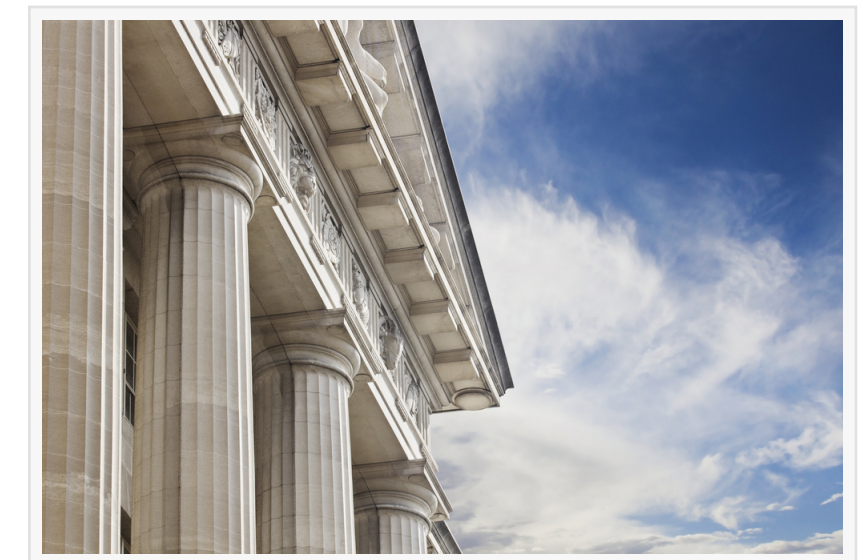
Cleanbox Technology can keep government employees safe while saving money and reducing the environmental impact of cleaning wipes

Cleanbox Was Made for This Before the pandemic, Cleanbox's founder and CEO was considering a project at the Smithsonian for immersive virtual reality experiences. The biggest challenge facing this project was keeping VR headsets clean for a facility that received 30 million visitors a year. The Smithsonian project didn't materialize, but it did give rise to