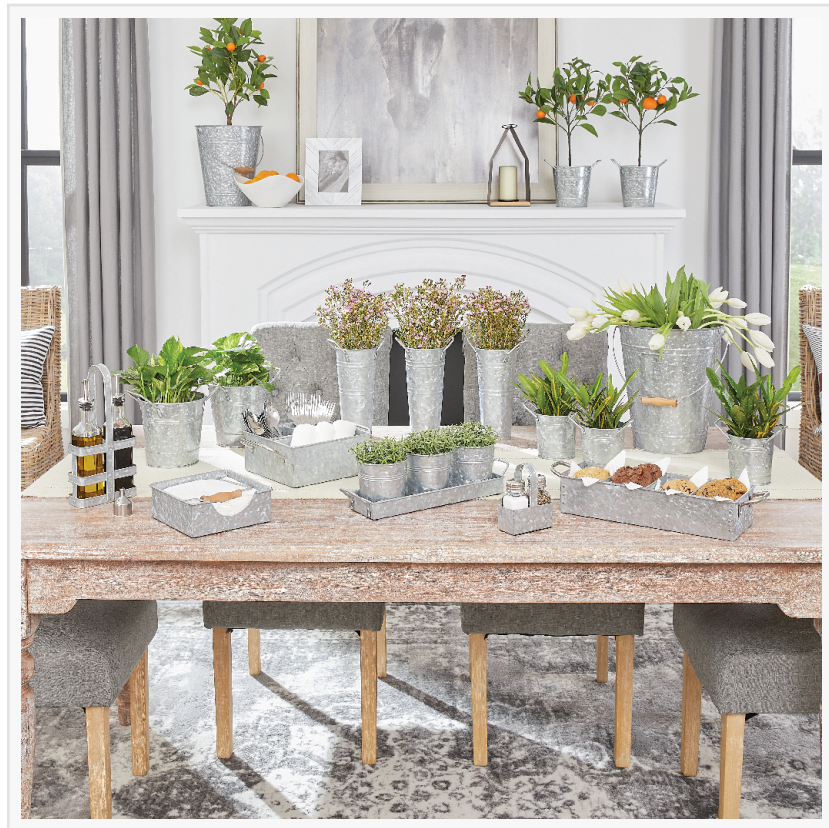
Walford Home's Garden Collection

Ashford Blue Walford Home, LLC +1 984-464-2950 email us here