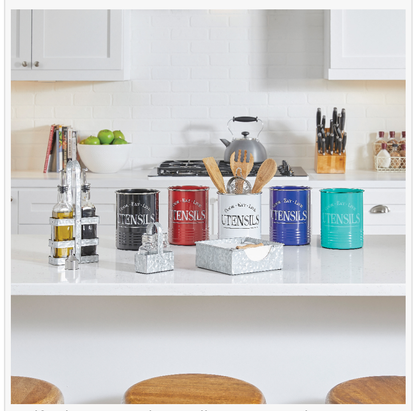
Walford Home Kitchen Collection - Farmhouse Decor