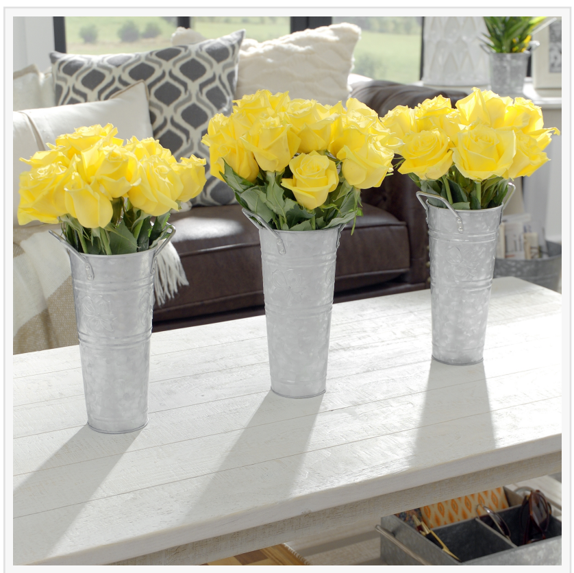
Walford Home French Flower Vases Sold in Set of 3 or 12