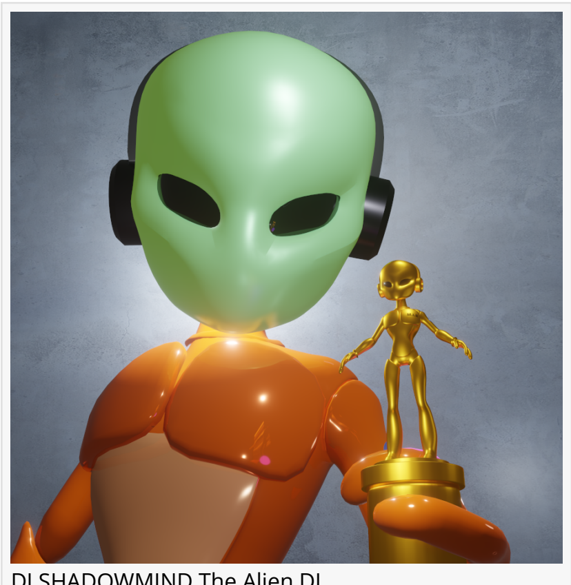
DJ SHADOWMIND The Alien DJ

As the song suggests, it is a feel-good tune about having a good time with friends in the summer. The song is energetic, with dance-able beats, but can also be a perfect chill-out beat on the beach. The vibe picks up as you get to the drop, and you realize it's more than just a driving song.