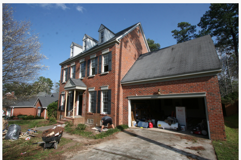
House bought by Augusta Home Buyers

Augusta Home Buyers is a local cash house buyer in Augusta GA that provides win-win solutions to help homeowners escape their sticky situations, including foreclosure, owning a burdensome property, probate, divorce settlements, probate, unwanted rentals, or anything else. Their focus