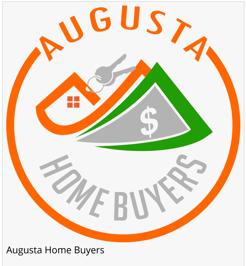
Augusta Home Buyers

“When you work with us, there are no fees and no commissions like when you list your house with a traditional agent. You never have to worry about any extra costs to sell your house fast coming out of your pocket or even getting your house “market-ready” to sell. We want to buy