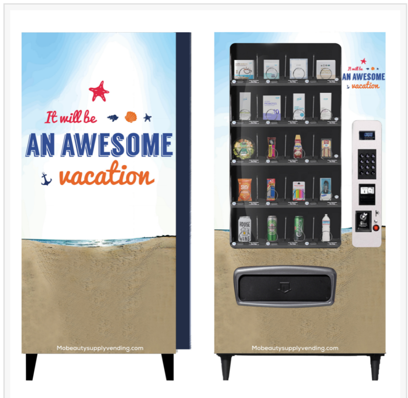
Vending Machine Customized with a Beach Style Wrap

Summer Grinwis Sunshine Public Relations mobeautysupplyvending@gmail.com