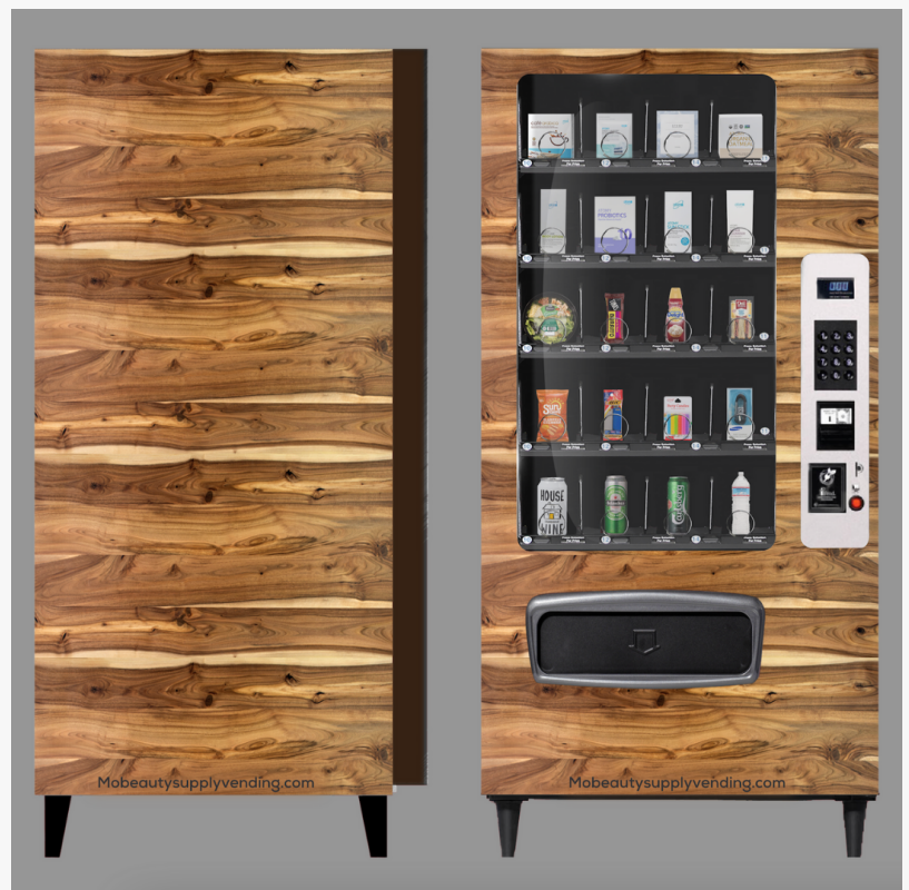
Air Vacations and Vending Customized Vending Machine with a wood grain wrap