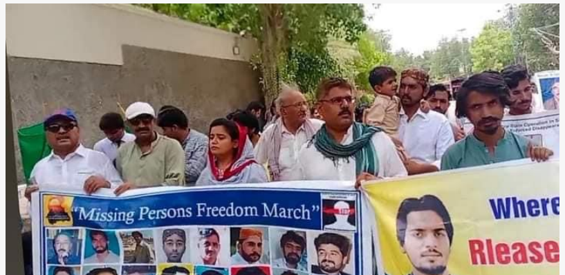
Protest against Enforced Disappearances in Sindh