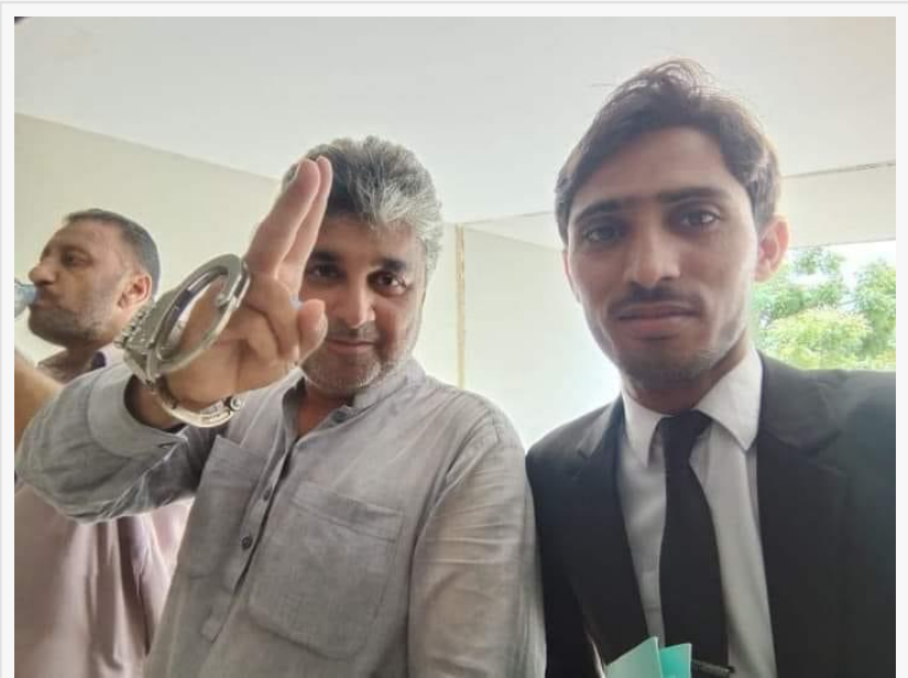
Sindhi Inam Forcibly taken away from Press Club Karachi

The ICAED is a global umbrella organization of voices raised against enforced disappearances. It is mandated to campaign for the universal ratification and implementation of the International Convention for the Protection of All Persons from Enforced Disappearance. In view of the cases of enforced disappearances in Sindhi region and the rest of Pakistan, ICAED calls on Pakistan to ratify the International Convention for the Protection of All Persons from Enforced Disappearance without further delay and to recognize the competence of the UN Committee on