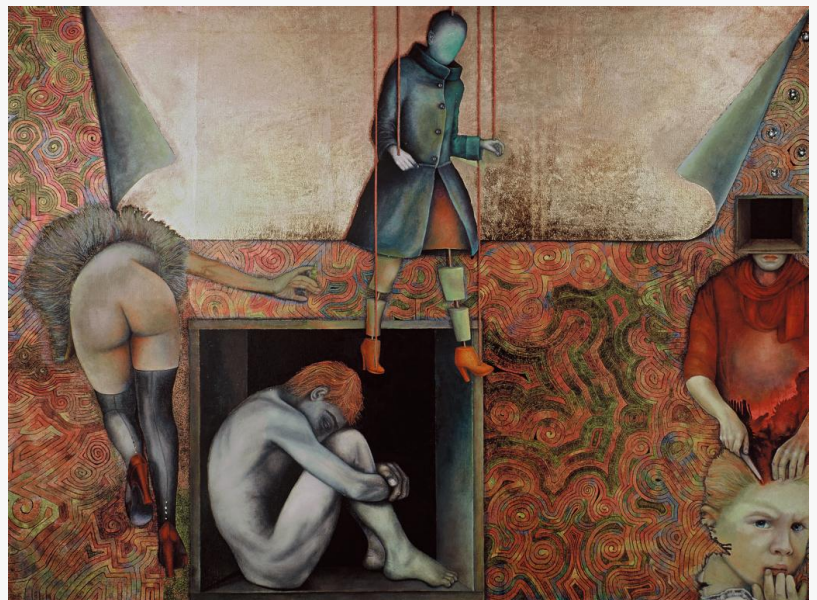
Painful Reality of Human Relations